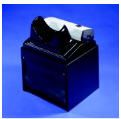
C-10E Cabinet with four watt lamp