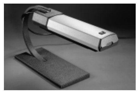
Universal stand for all EL Series Lamps