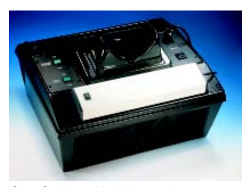
C-65 Cabinet with eight watt lamp